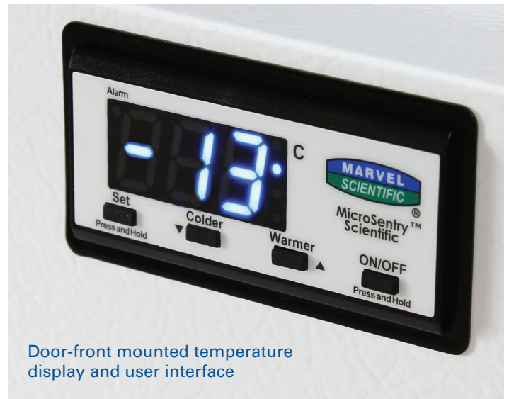
Door-front mounted temperature display and user interface